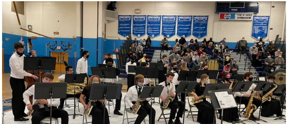
Jazz Band Performs !