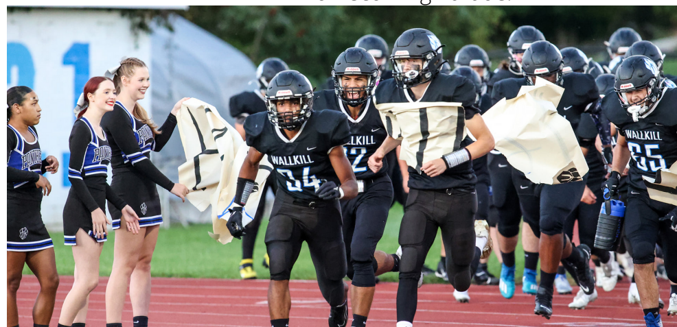
Varsity Football defeated Valley Central 7-0. They finished the season 6-3!