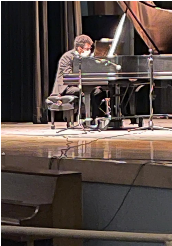
Music Variety Show!

The Fall 2021 Pops Concert, Variety Show, and Drama Production were a success as Panthers performed live for family and friends! Winter Concert is scheduled for December 14, 2021!