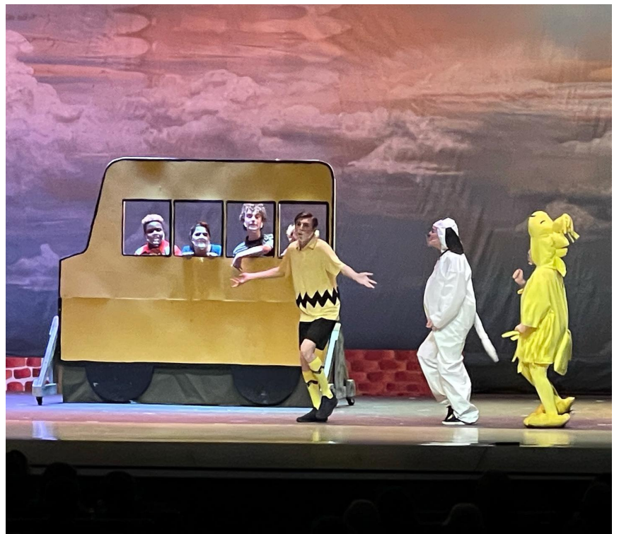
"You're A Good Man, Charlie Brown"